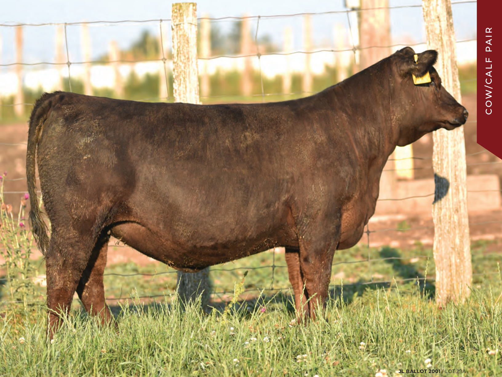
JL BALLOT 2001 / LOT 29A