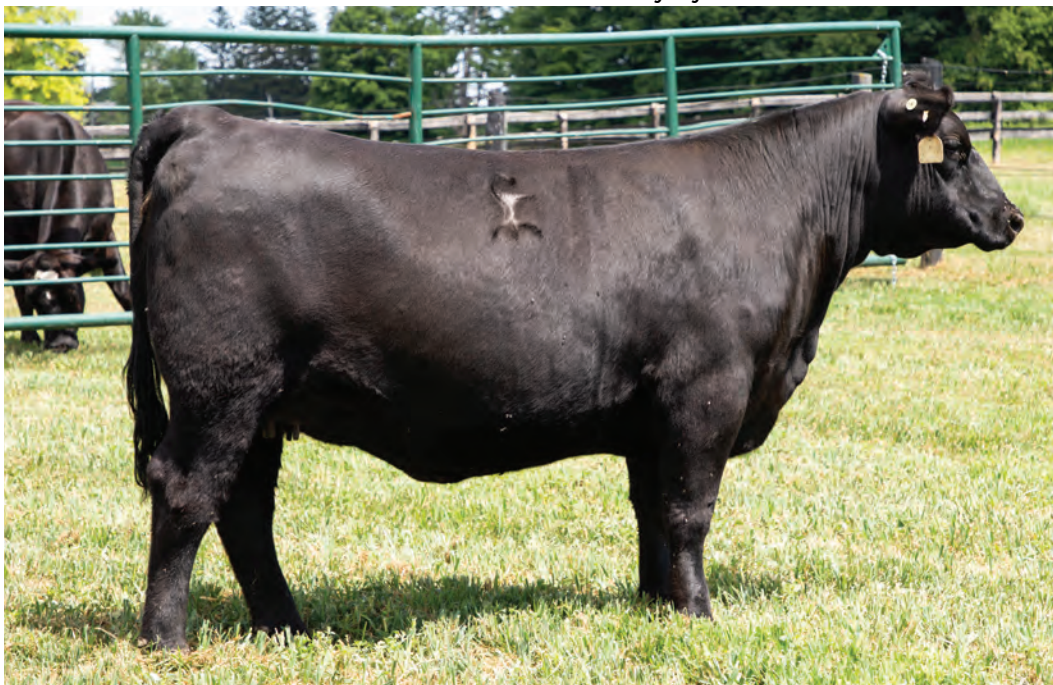
COTTONWOOD BALLOT 12J / LOT 60