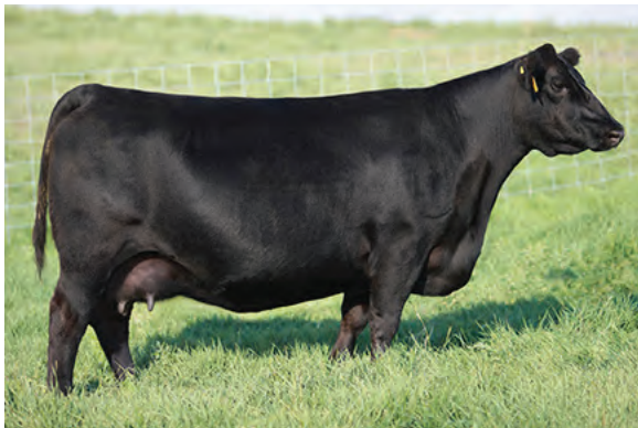
SOO LINE LADY 8058 || DAM

Lady 8G comes from a “who’s who” of great Canadian breeders, Brooking, Cudlobe, Soo Line, JL and Peak Dot...the Lady’s of Peak Dot needs no introduction. 8G’s dam and granddam have registered over 60 offspring combined. Brooking Silver Lining is her accomplished brother at Brooking and W Sunrise...her dam’s sister is a feature donor at Poplar Meadows, whose 5 daughters opened their sale last fall, grossing over $100,000...Lady 8G is the typical moderate and beautiful uddered cow we’ve come to expect from S A V Renovation. We have a Charlo daughter and the calf selling at side will showcase her breeding ability Offered By: Meadow Bridge Angus