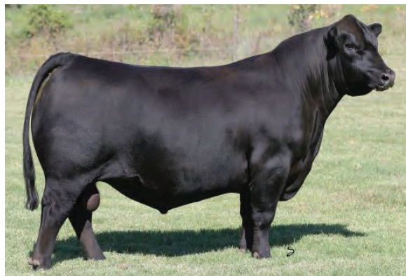
STEVENSON TURNING POINT || SERVICE SIRE