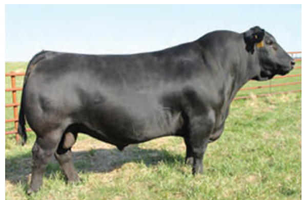
S A V RESOURCE 1441 || SIRE OF EMBRYOS