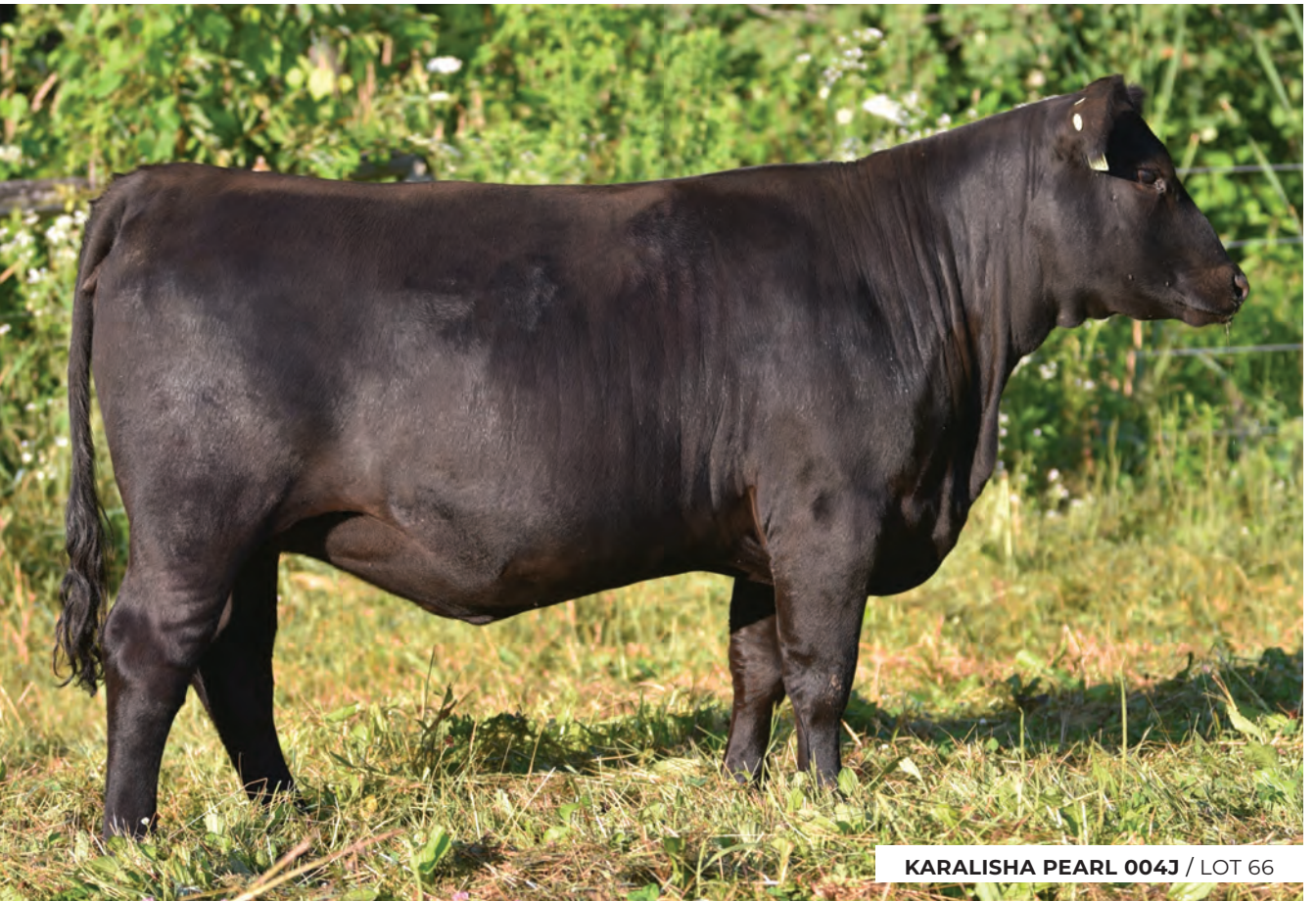
KARALISHA PEARL 004J / LOT 66