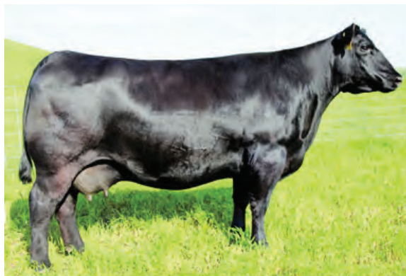
S A V BLACKCAP MAY 4136 || SISTER TO DAM