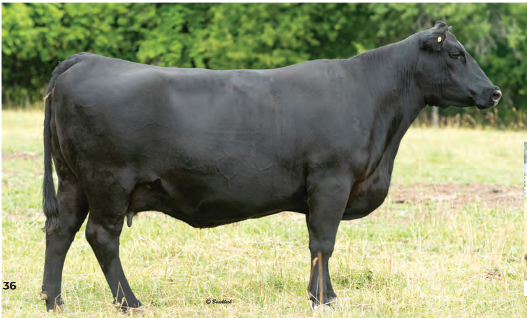
PFLC BARDETTA 238E / LOT 28