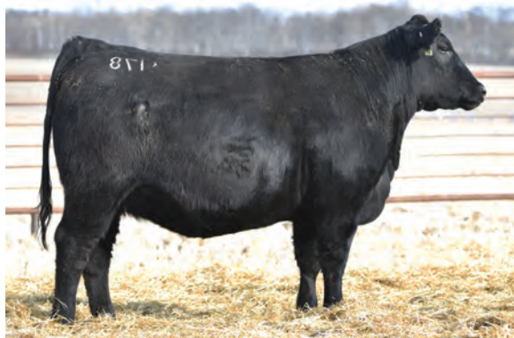
JL PRINCESS 9178 || AS A BRED HEIFER

AI bred to S A V Bloodline 9578 on April 29, 2022. Ultrasound preg checked safe.