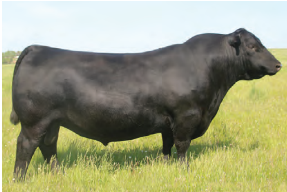
S A V RAINFALL 6846 || SERVICE SIRE