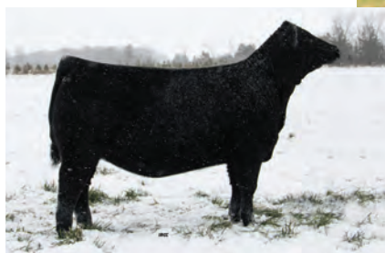
PREMIER HASSON EMPRESS 917 || DAM