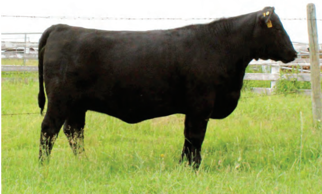
JUSTAMERE LM 41F LADY 363J / LOT 58

Offered By: Lynden Manor Farm and Justamere Farms Ltd.