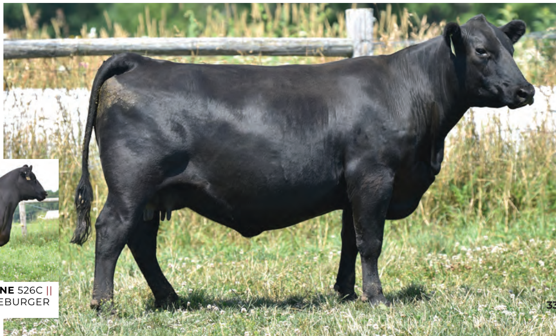
REHORST REGARD JUNE 11H / LOT 25