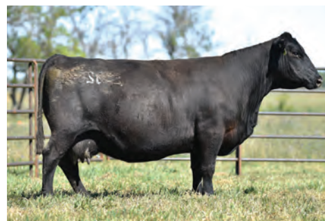
JL BALLOT 0204 || DAM OF LOT 29