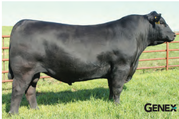
S A V TEN SPEED 3022 || SIRE