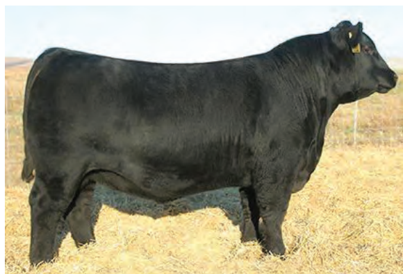
S A V QUARTERBACK 7933 || SIRE OF LOT 36 AND 37