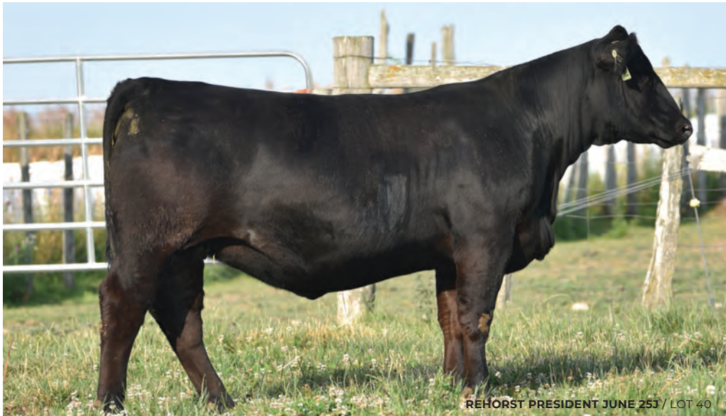
REHORST PRESIDENT JUNE 25J / LOT 40