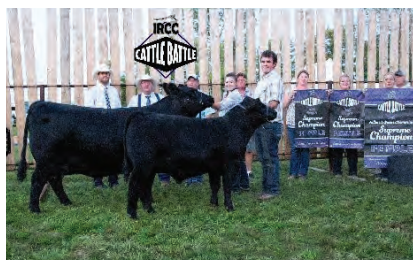
WORTH-MOR SHAKURA 5E || SUPREME CHAMPION 2021 CATTLE BATTLE