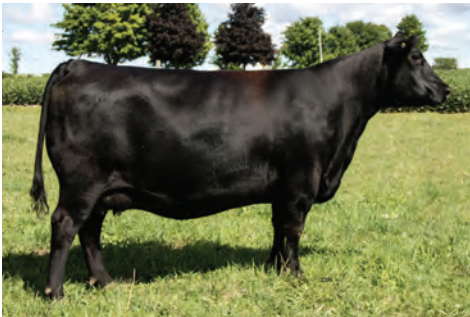
GILLCO VELVET 3A || DAM AT PARKVIEW FARMS

Here is an awesome Velvet package. A beautiful Conversation mother with a tremendous SAV Territory calf at side. She is bred to female sexed Musgrave Crackerjack for an early January calf. Velvet 3E carries all the wonderful Velvet traits, profiles beautifully, has an impeccable udder, she is deep bodied and square hiped. Her dam Velvet 3A is working well as a donor at Parkview Farms. She is haltered and quiet. Offered By: Gillco Farms