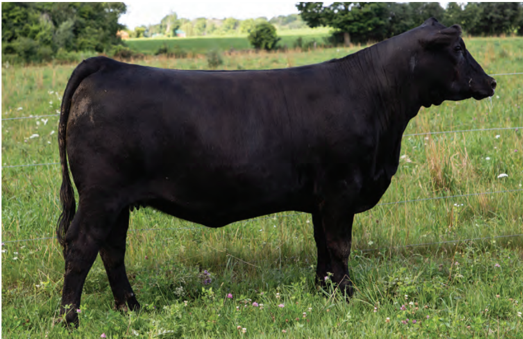
KEMP BROTHERS ZARA 430H / LOT 50