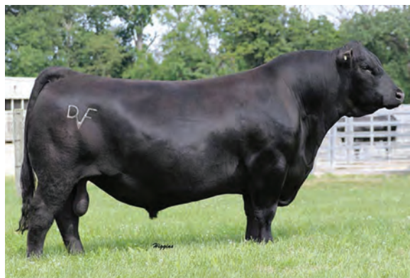
DEER VALLEY GROWTH FUND || SERVICE SIRE

AI bred to Deer Valley Growth Fund on March 28, 2022. Ultrasound preg checked safe to AI date.