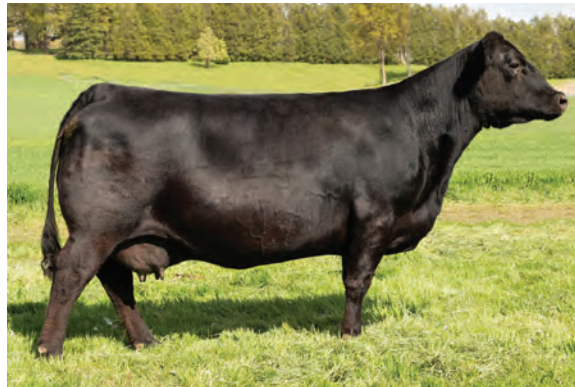
JL BLACKCAP MAY 4424 || DAM

AI bred to S A V Early Arrival 0903 on July 4, 2022.