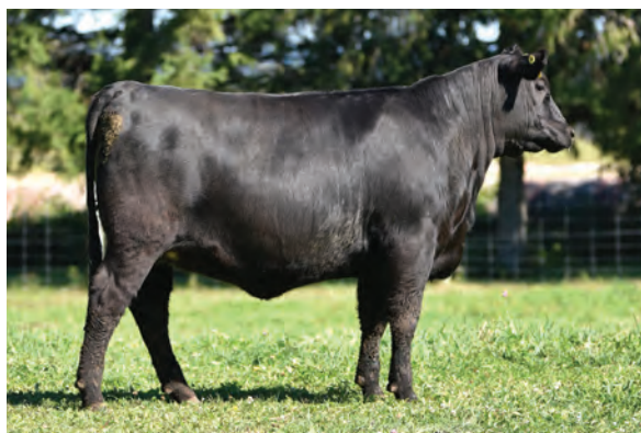
ANGUS HILLS PATRICIA 4J || AS A HEIFER CALF