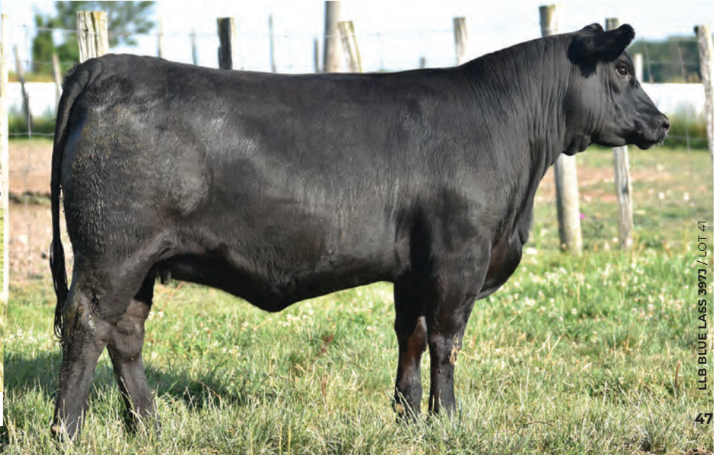
LLB BLUE LASS 397J / LOT 41