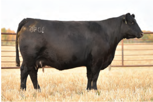
JL LADY 8050 || PICTURED AS A TWO YEAR OLD