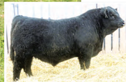
JL PRESEASON 5071 || SIRE