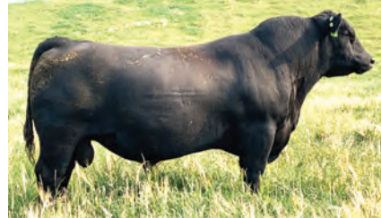
RIVERCREST NO DOUBT CSP 9F || SIRE OF LOT 41