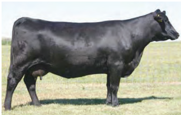
S A V MAY 2397 || GREAT GRANDDAM