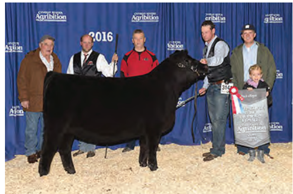
BROOKING LADY 6101 || SISTER TO LOT 15, 2016 CWA INTERMEDIATE CALF CHAMPION