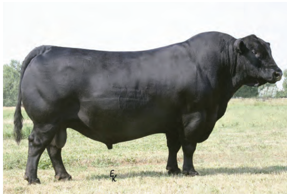
S A V FINAL ANSWER 0035