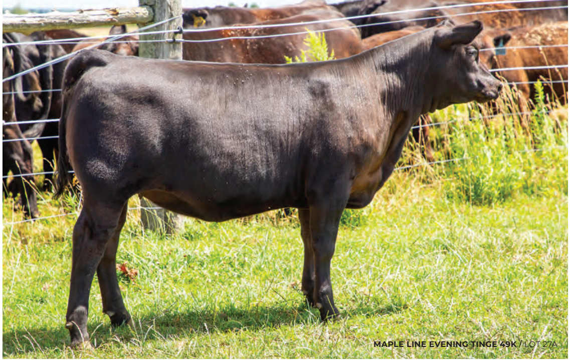
MAPLE LINE EVENING TINGE 49K / LOT 27A