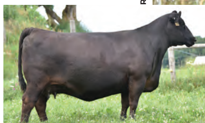
REHORST ELIMINATOR JUNE 526C // MATERNAL SISTER AT FRIEBURGER CATTLE CO.