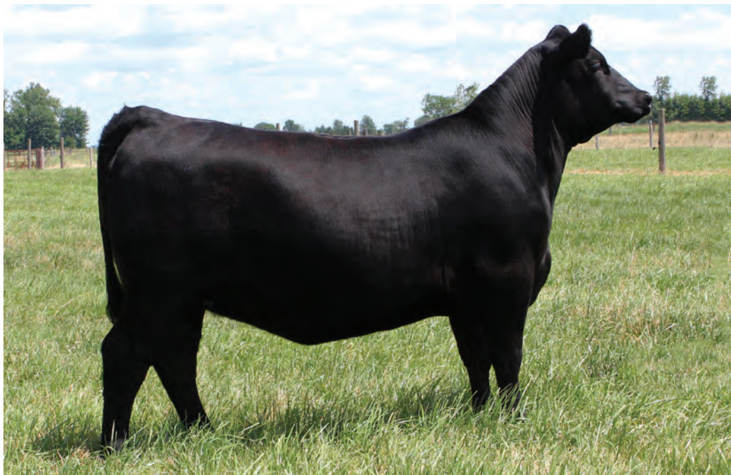
CJR AGNES 11J / LOT 43