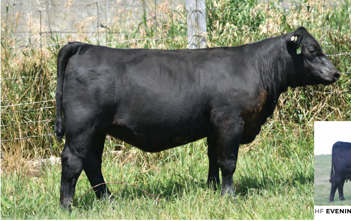
CUDDY EVENING TINGE 2208K / LOT 24A