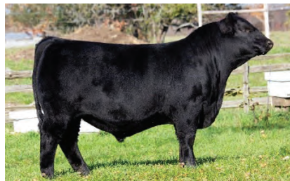
MVL JAGER BOMB || FIRST SON VALUED AT $30,000