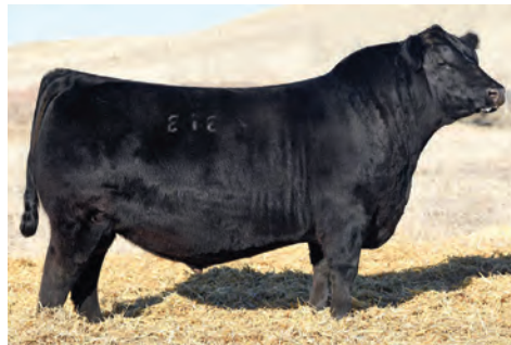
COLEMAN BRAVO 6313 || SIRE OF LOT 75