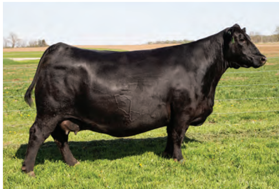
MBA TROJAN ERICA 701 || FULL SISTER TO DAM

An SAV Brilliance daughter from a show winning Final Product dam. 706 is an extreme feminine cow with a beautiful udder, we have 2 daughters at Meadow Bridge Offered By: Meadow Bridge Angus