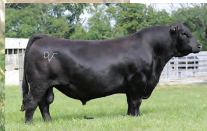
JL HENRIETTA 0065 / LOT 6