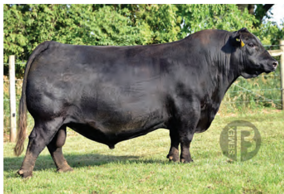
MUSGRAVE 316 COLOSSAL 137 || SERVICE SIRE