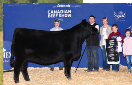
WIWA CREEK BELLEMERE 1743 || DAM