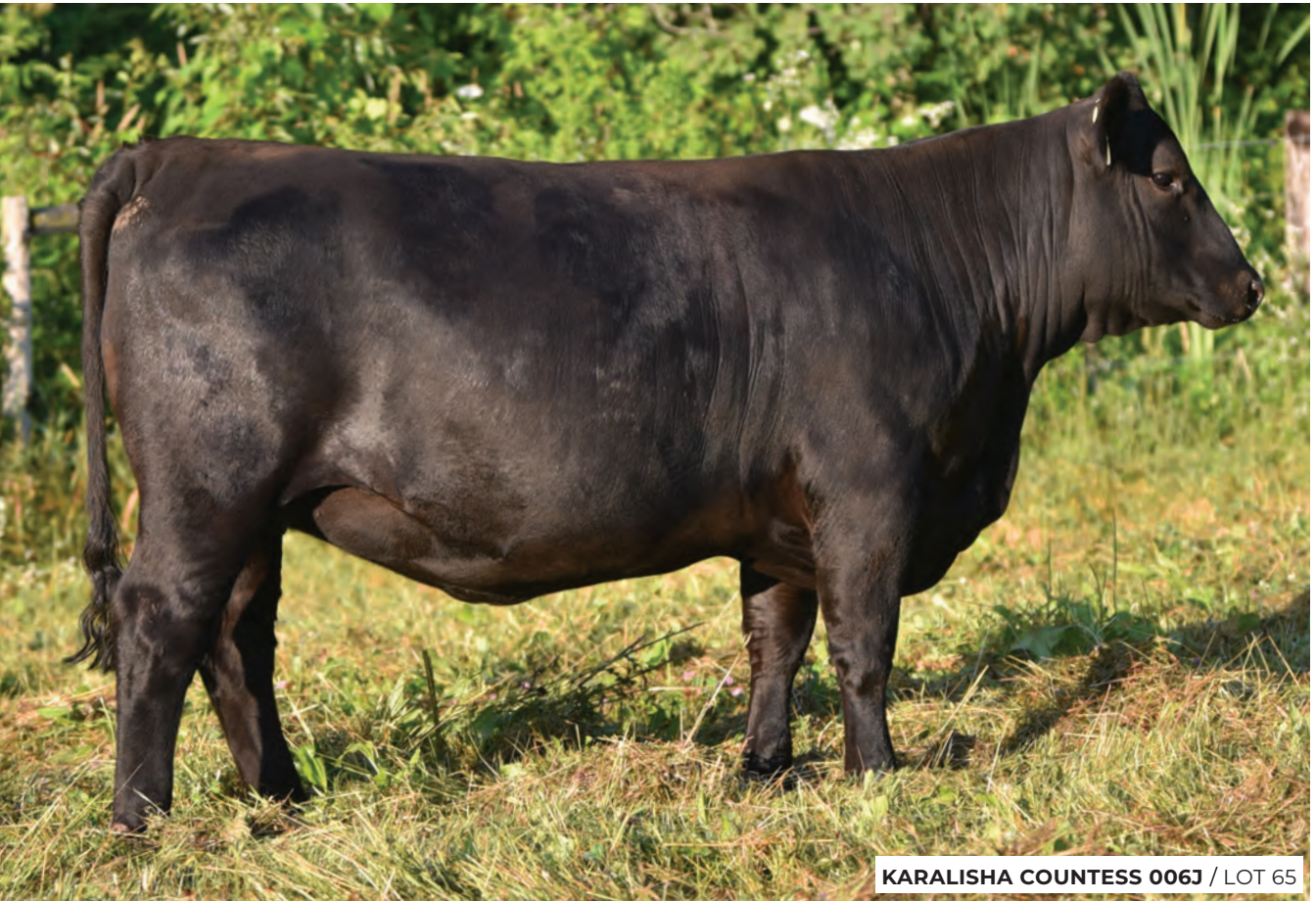
KARALISHA COUNTESS 006J / LOT 65