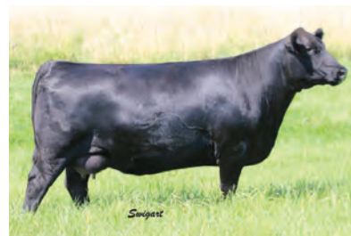
PVA BLACKCAP MAY 4197 || DAM

Guarantee one pregnancy if implanted by a certified technician. Offered By: Meadow Bridge Angus