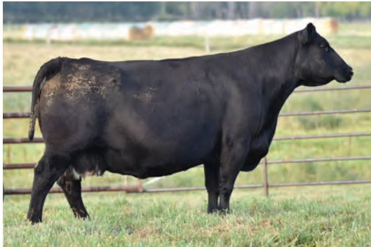
JL LADY 0016 || DAM OF LOT 76