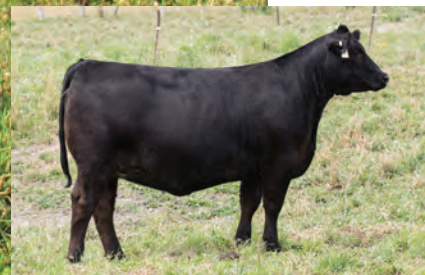
DDGN BELLEMERE 909G || MAT SISTER