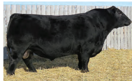
YOUNG DALE BELIEVE 46B // SIRE OF LOT 47