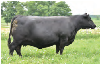
REHORST JUNE 342A // DAUGHTER AT CAMBRAY