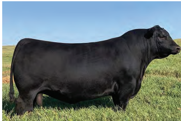
S A V AMERICA 8018 || SIRE

AI bred to S A V America 8018 on April 10, 2022.