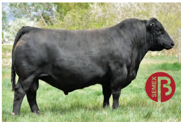
SCHIEFELBEIN ATTRACTIVE 4565 || SIRE

Offered By: Cedar Springs Farms and Weppler Cattle Co.