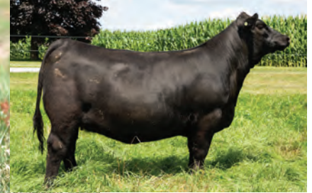
REHORST RAINFALL MAYFLOWER 205K / LOT 21A