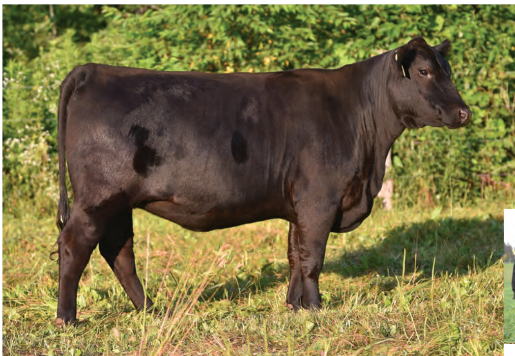
KARALISHA KATINKA 003J / LOT 64