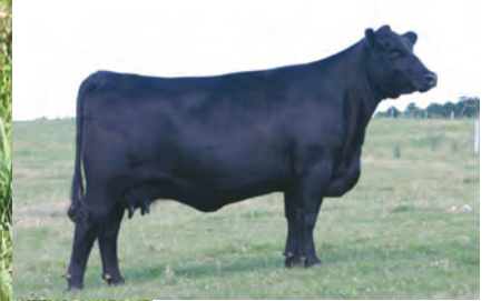
HF EVENING TINGE 57R || GRANDDAM OF LOT 24