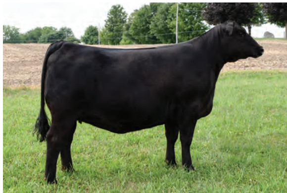
GILLCO VELVET 10H || MATERNAL SISTER AT ELLSMERE