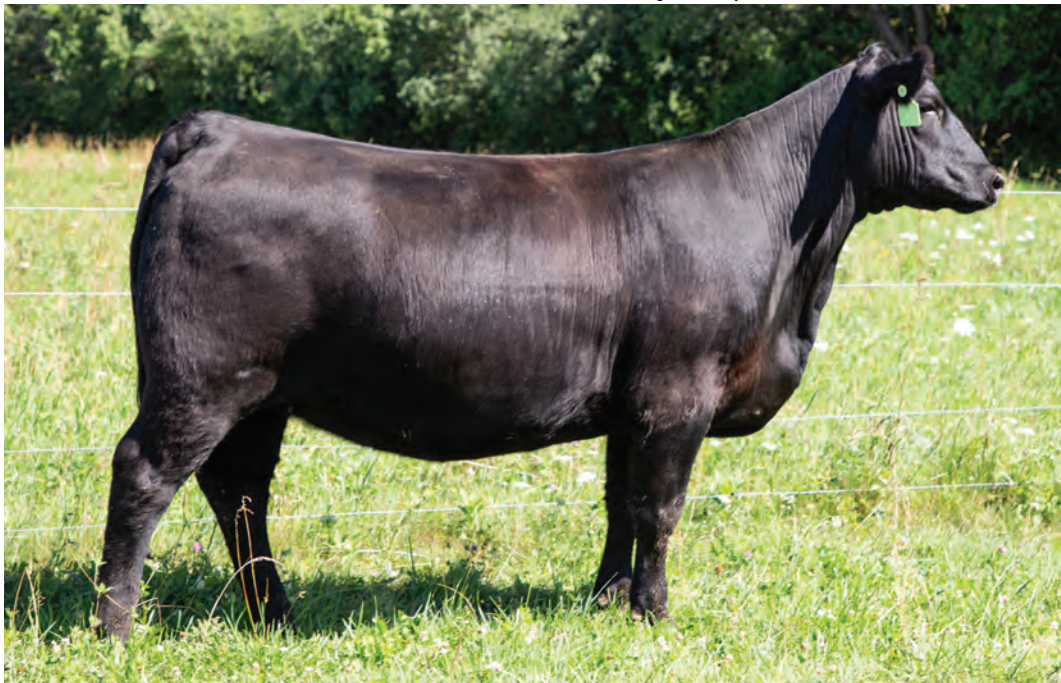
KEMP BROTHERS VENESA 11J/ LOT 54