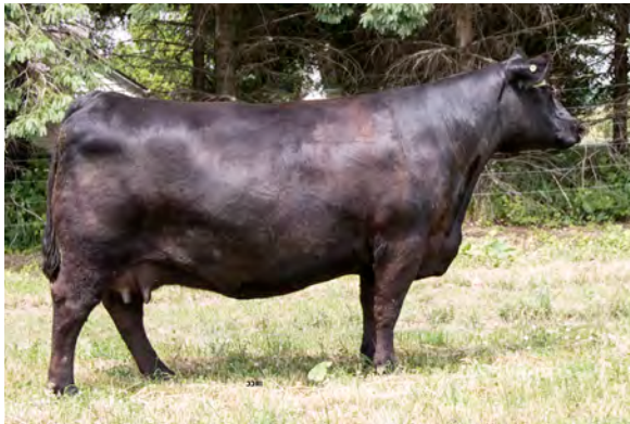
NORTH PERTH TROJAN ERICA 309 || DAM