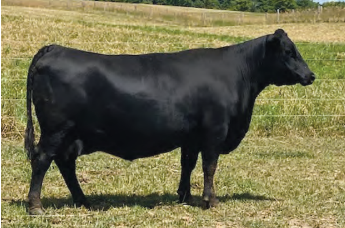
WILLOWBROOK BLACKBIRD 02G / LOT 11