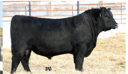
3 "G" THUNDERBIRD 14D || SIRE OF LOT 38