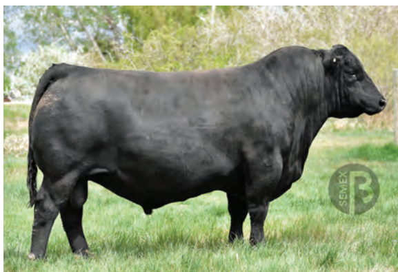
SCHIEFELBEIN ATTRACTIVE 4565 || SIRE