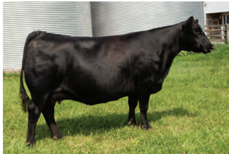
GILLCO VELVET 1B || SISTER TO DAM AT PARKVIEW FARMS