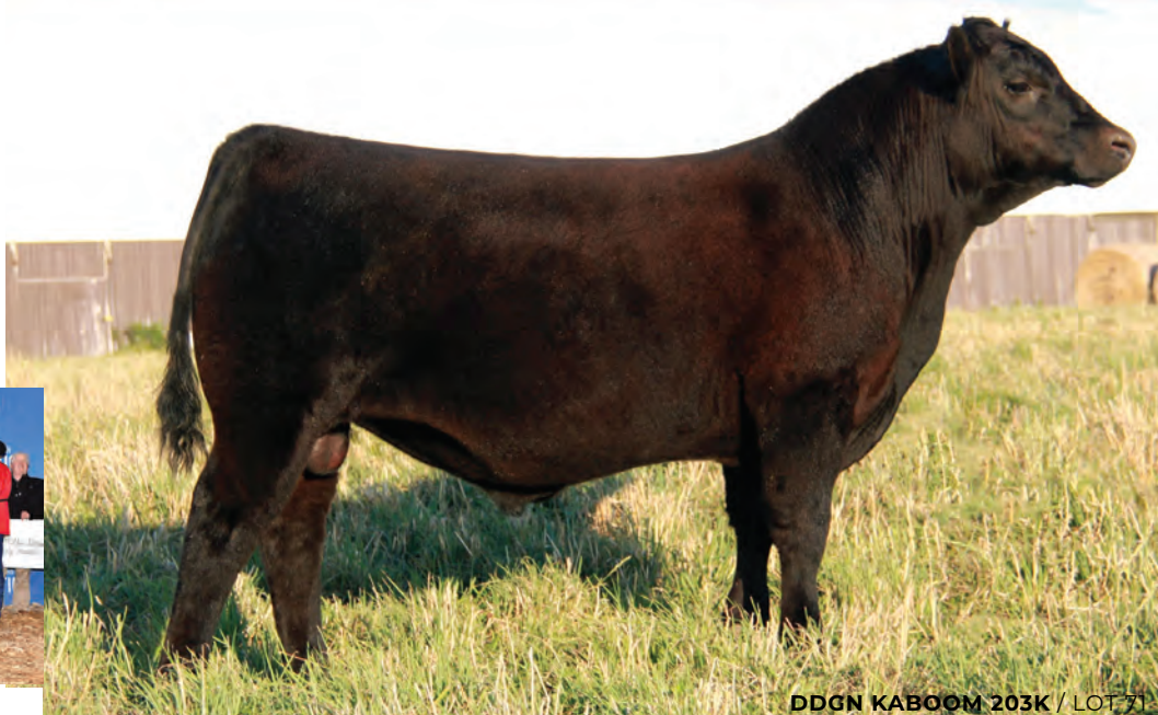
DDGN KABOOM 203K / LOT 71