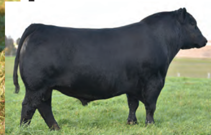
GF LUCKNOW 905G || SIRE