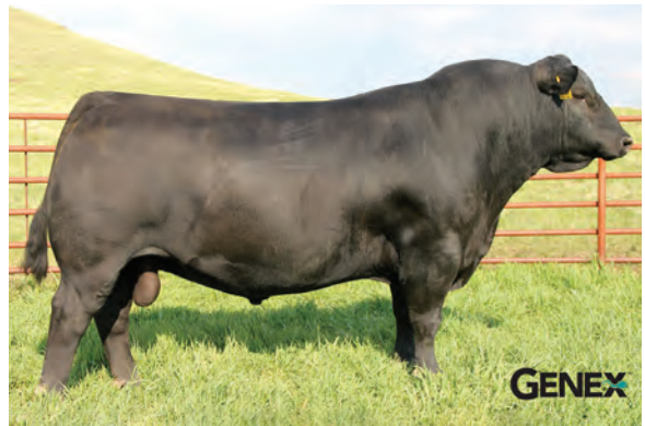
S A V ANGUS VALLEY 1867 // FULL BROTHER TO DAM