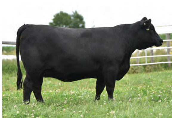
LLB MCHENRY BLACKCAP 337H || DAM