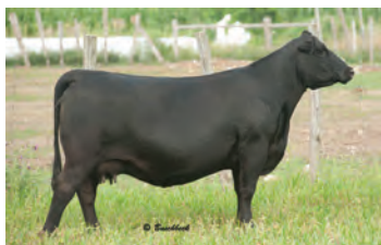
REHORST ELIMINATOR JUNE 502C // $30,000 DAUGHTER AT STRONGBOW FARMS