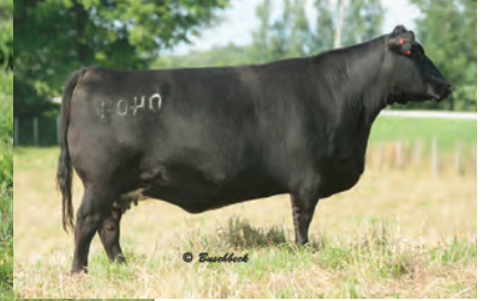
BUSCHBECK PRIDE 204K // LOT 26A SOO LINE PRIDE 0404 || DAM OF LOT 27