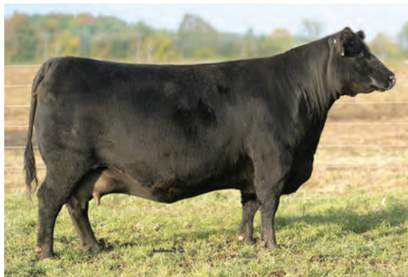
PFLC PURE PRIDE 16D || DAM

805 is a deep bodied daughter of breed legend SAV Final Answer 0035, from Pure Pride 16D, the matriarch of the family. One of 8 sisters at Meadow Bridge, Cash Cattle and Vissers Angus. She is the #1 Calving Ease cow in our herd and genomic tested to be in the top 1% of breed. From Final Answer to EXT 805 completes 6 generations of pathfinder sires. We are retaining President and Raindance daughters. Offered By: Meadow Bridge Angus