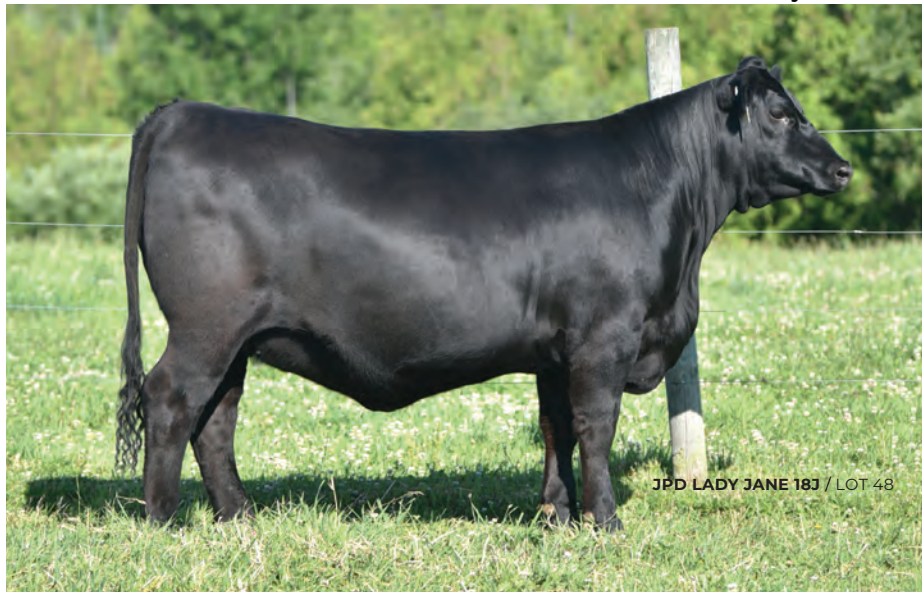
JPD LADY JANE 18J / LOT 48