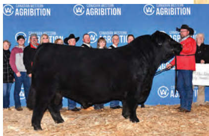
DMM MAXIMUS 18G || SIRE