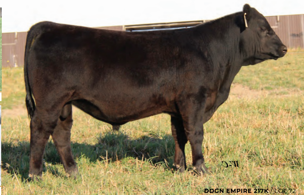
DDGN EMPIRE 217K / LOT 72