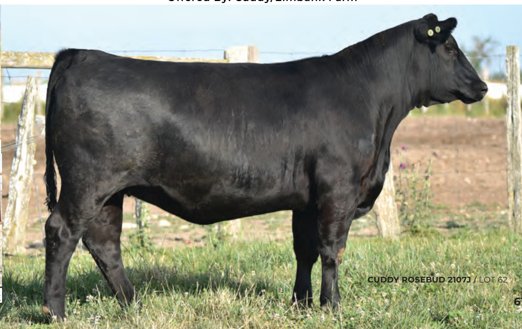
CUDDY ROSEBUD 2107J / LOT 62