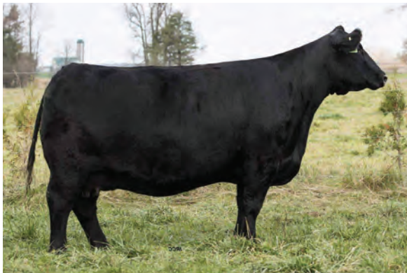
NORTH PERTH SIEBRING MAY 2561 // DAM, FULL SISTER TO S A V ANGUS VALLEY