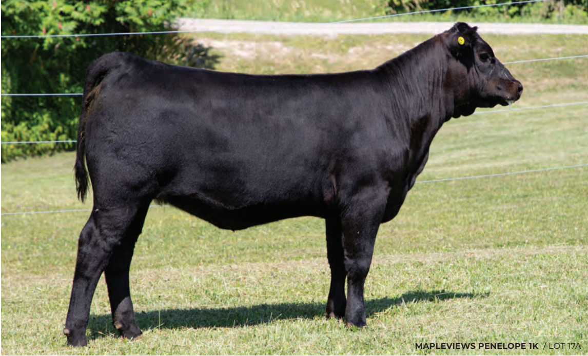
MAPLEVIEWS PENELOPE 1K / LOT 17A