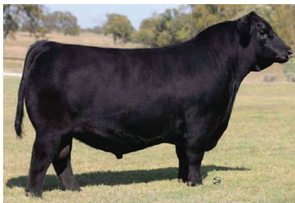
CONLEY SOUTH POINT 8362 || SERVICE SIRE