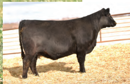
JL CASSIE 9010 / LOT 5