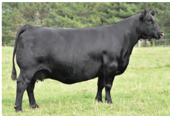
GILLCO ALLEGRA 2A || SISTER TO DAM, $40,000 HIGH SELLER TO STRONBOW FARMS