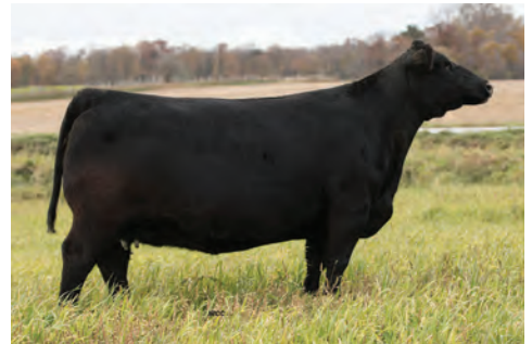
GILLCO VELVET 1Z || SISTER TO DAM AT DUDGEON CATTLE