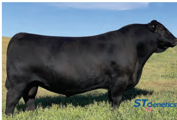
S A V TERRITORY 7225 || SIRE