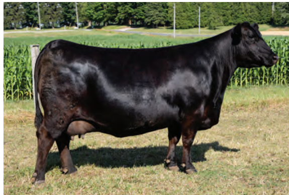
PFLC LUCY 9760E || DAM