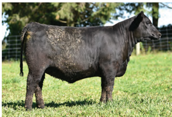
ANGUS HILLS BARBARA 6J || AS A HEIFER CALF