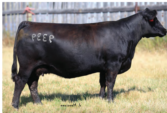
SOO LINE LADY 9339 || SISTER TO DAM AT POPLAR MEADOWS