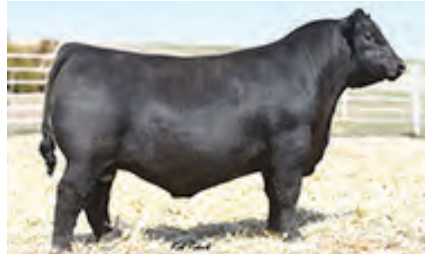
MOHNEN GENERAL 548 || SIRE OF LOT 40