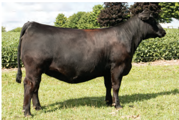
GILLCO ALLEGRA 2G || SISTER TO DAM, AT ELLSMERE

We are happy to offer one of the great Allegra's to the AAC Sale. Allegra 1J is an outstanding President daughter out of a Vision Unanimous mother and her great grandam being Gillco Allegra 5T the cornerstone Allegra at Gillco. Allegra 1J is a moderate framed female who is deep bodied and corners down on a great set of feet and legs. She is a potential donor brood cow in the making. She is haltered and quiet. Offered By: Gillco Farms