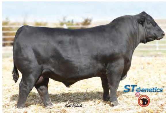
MUSGRAVE CRACKER JACK || SIRE