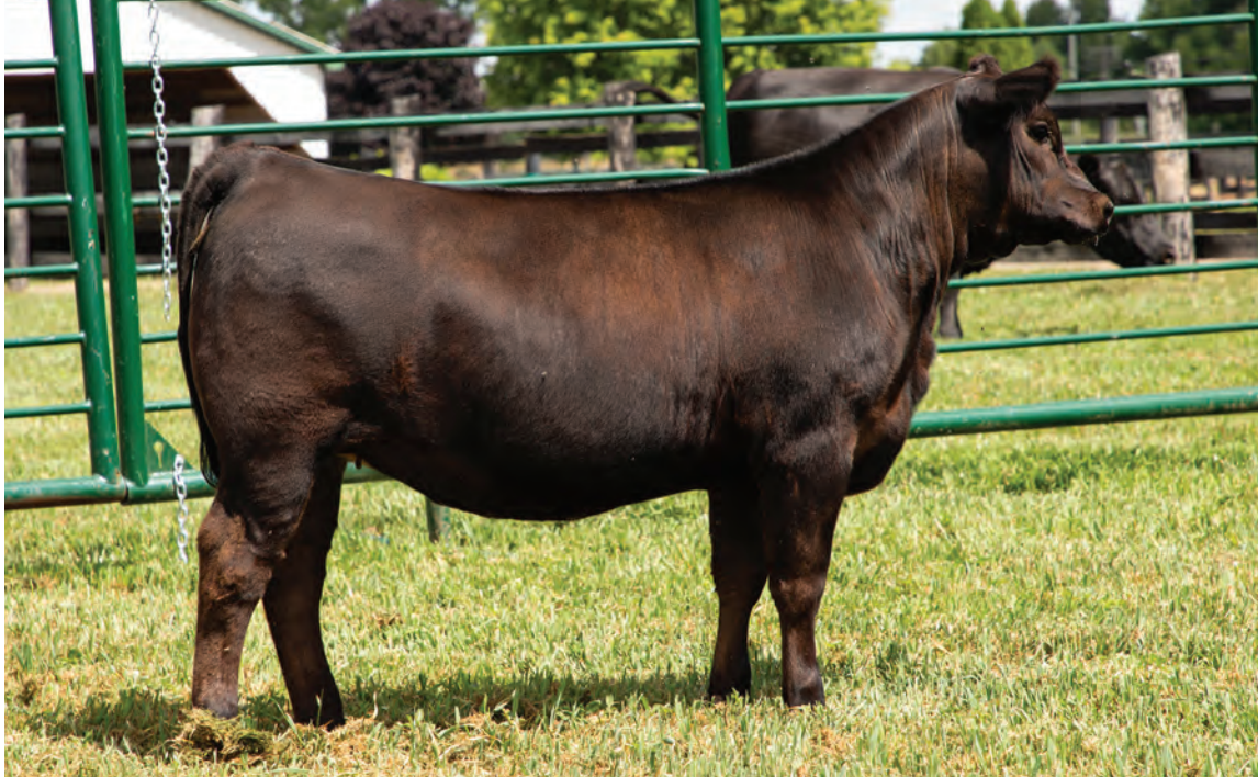
LYNDEN MANOR BETTY 2K / LOT 22A