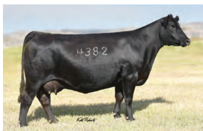
KR LADY MAY 4382 || DAM OF LOT 61