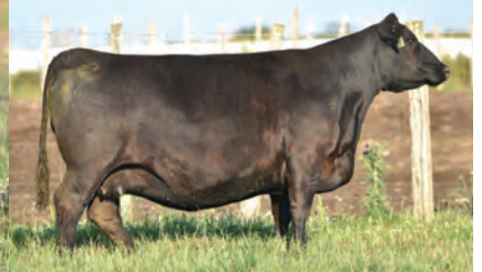
JL JUNE 1070 || DONOR GRANDDAM OF LOT 39