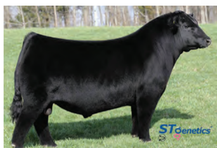
CONLEY DIECKMANN PROWESS || SIRE