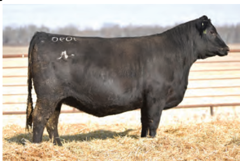
JL BALLOT 9090 || PICTURED AS A BRED HEIFER