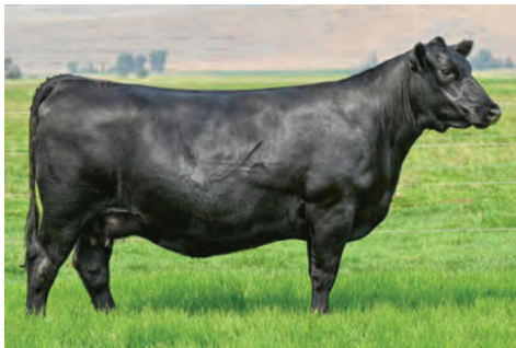
COLEMAN CHLOE 900 || DAM OF LOT 76