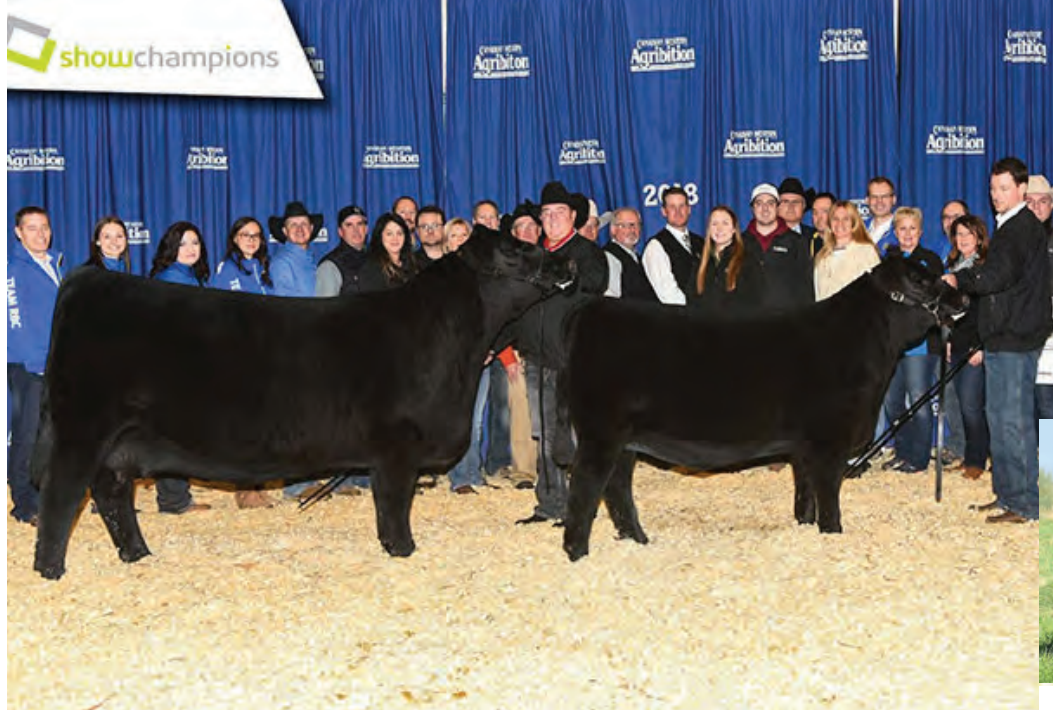
PM ECHO 8'16 / DAM OF LOT 73