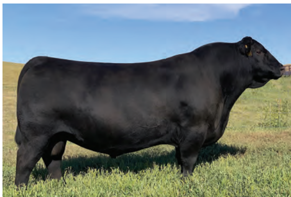
S A V TERRITORY 7225 || SIRE