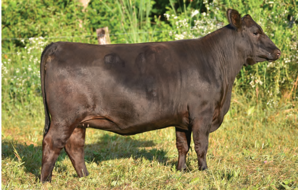
KARALISHA PERSEPHONE 011J / LOT 63