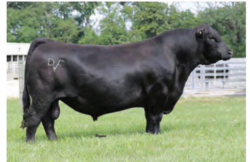
DEER VALLEY GROWTH FUND || SIRE OF LOT 76