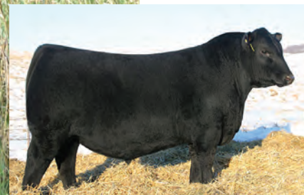
S A V BLOODLINE 9578 || SERVICE SIRE