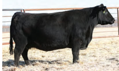
F V ROSEBUD FA 308Z || DAM OF LOT 62