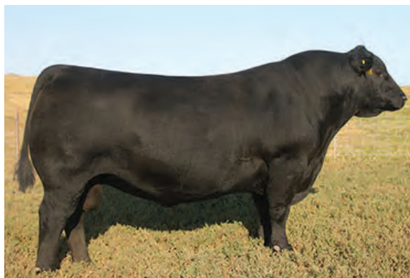
S A V SEEDSTOCK 4838 || SIRE OF LOT 18

NOTE: THIS LOT SELLS TOGETHER, AS A PAIR