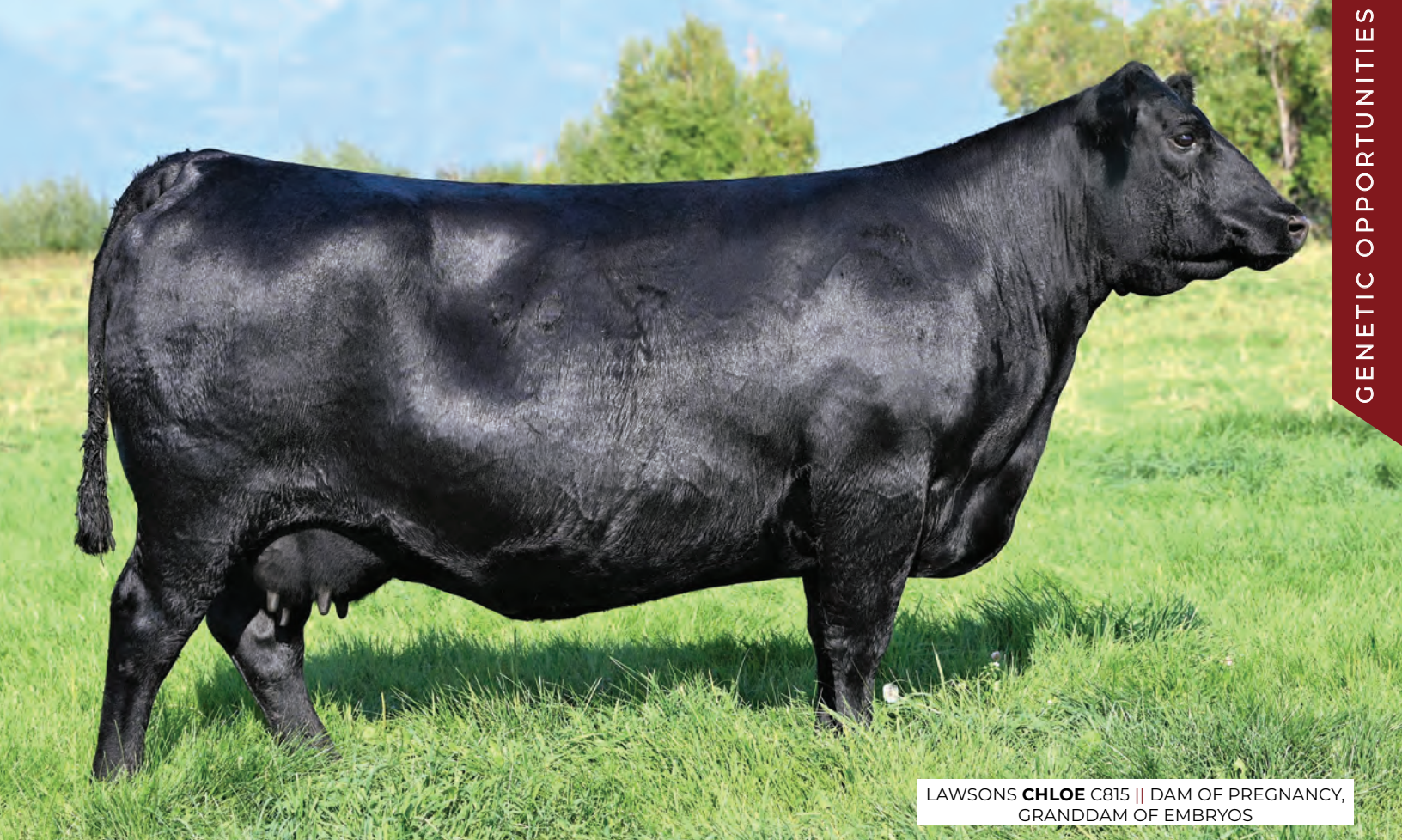
LAWSON'S CHLOE C815 || DAM OF PREGNANCY, GRANDDAM OF EMBRYOS