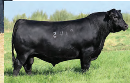
COLEMAN TRIUMPH 9145 || SIRE