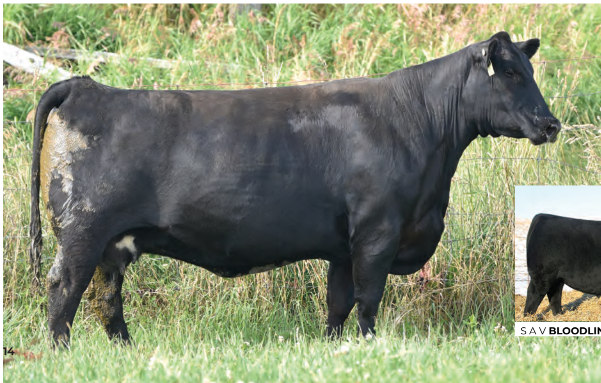
FIVE R ERICA 12F / LOT 12