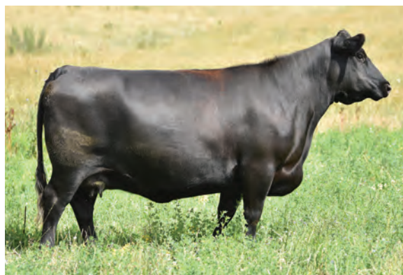
REHORST EVENING TINGE DAK 620D || GRANDDAM