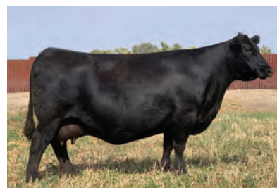
S A V EMBLYNETTE 3293 || DAM

AI bred to S A V Bloodline 9578 on January 24, 2022. Pregnancy is sexed female.